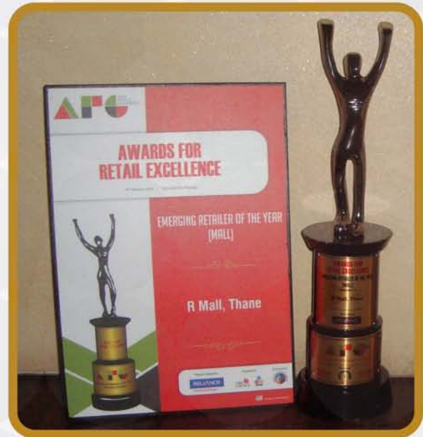
'EMERGING RETAILER OF THE YEAR (MALL)'