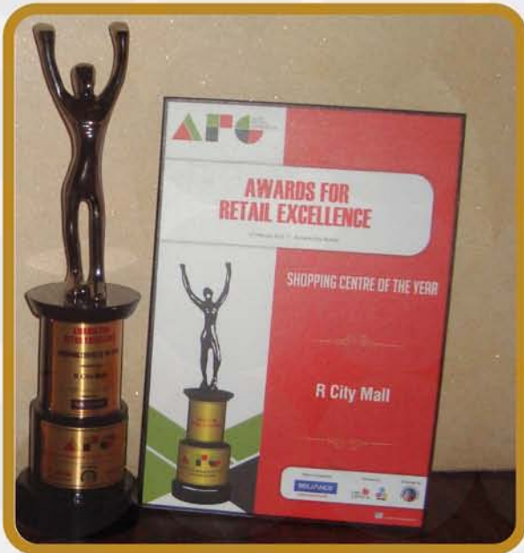
'SHOPPING CENTRE OF THE YEAR'

THE RUNWAL GROUP, OWNER OF THE BIGGEST RETAIL MALL CHAIN IN THE CITY, HAS BEEN AWARDED FOR RETAIL EXCELLENCE AT THE ASIA RETAIL CONGRESS 2012.